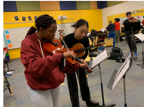
Music 490S, Fall 2022

Duke Service-Learning will continue the important work of supporting Duke faculty as they innovate the intentional integration of high-impact, community-engaged practices. curriculum. SLCE courses complement the campus' renewed and emerging interests in understanding our place and time, expanding a sense of belonging and well-being, and deepening critical reflection, as they are foundational themes and practices in community-engaged